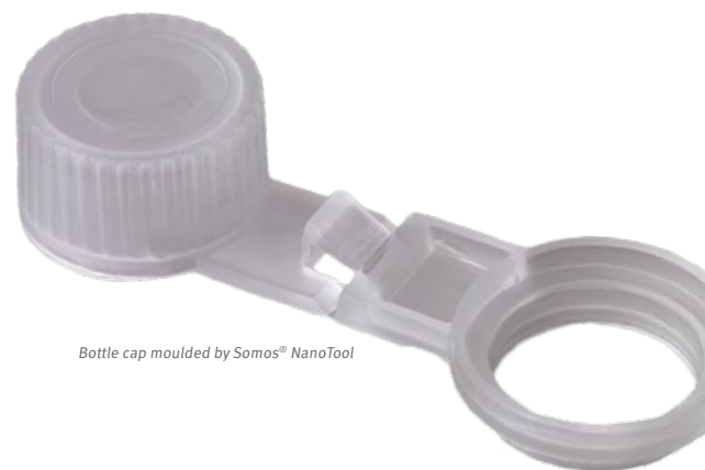
Bottle cap moulded by Somos® NanoTool